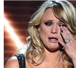
The truth finally uncovered Blake's calling it...