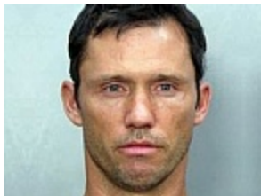
15 Famous Celebs Who Have Committed Horrible...