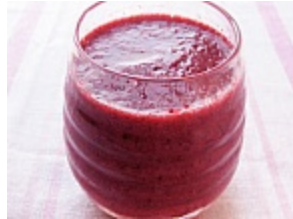
The #1 drink to FIGHT the real cause of diabetes...