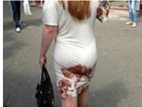
You Must See These Hilarious Embarrassing Photos