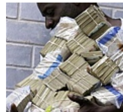
CIA Warning: 2016 U.S. I Run Will Leave...