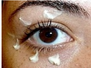
2 Easy Steps to 'Fix' Eye Bags and Remove...